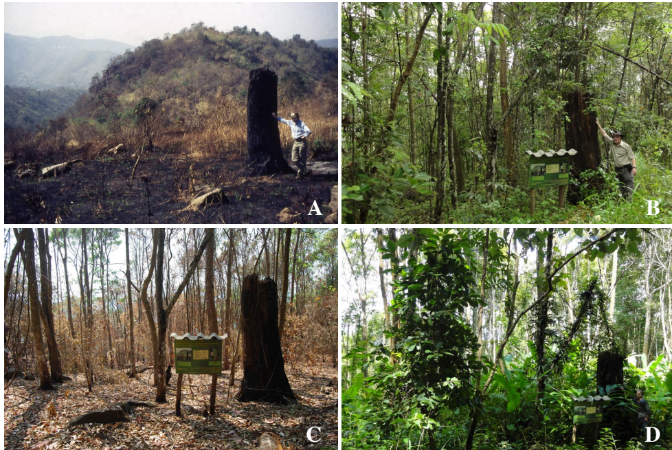
Figure 3. A desolate site in the upper Mae Sa Valley (A) was planted with framework tree species in 2000. Twelve years later (B) a structurally complex forest with high biodiversity was restored. But tree-chopping by villagers opened the canopy, allowing fire to destroy the understorey and kill many of the adult trees in 2016 (C). Two rainy seasons after the fire, dead standing trees dominate the plot and the understorey has been replaced with invasive herbaceous weeds and banana plants (D).

BMSM nursery) reduced the price of saplings by 20% below actual production costs (also contributing to the project “in kind”). This reduced total cash costs to 170,000 THB, freeing up a 30,000 THB underspend. The villagers then opted to invest this in establishing their own tree nursery. Having just learnt about sapling production costs (during the spreadsheet session) and having a potential buyer for 10 years (if Tipco continued with the project), they immediately recognized an opportunity to divert more of the project funding through the village economy in subsequent years. LEAF then offered to hire FORRU-CMU to run a workshop for the villagers in nursery management and tree propagation. Therefore, during the spreadsheet costing process, the villagers effectively agreed to forego payments to individuals (for labor), in favor of investing in a community venture with potential to generate income over many years subsequently, but at some risk (i.e. if TIPCO decided not to continue with the project after the first year).