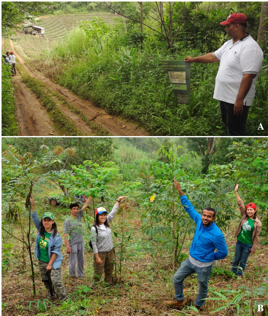
Figure 5. A, At BMSM, a student holds the remains of the 2009 plot sign. Immediately behind him, a few of the planted trees survived, but most of the plot in the background was converted into a cabbage field by 2016, perhaps reflecting waning commitment of villagers (“project fatigue”), as the project enters its 21 st year. B, In contrast, the BPK villagers maintained trees, planted in 2015, well. After 15 months, most of the trees had grown taller than 2 m, reflecting enthusiasm at the start of a project.