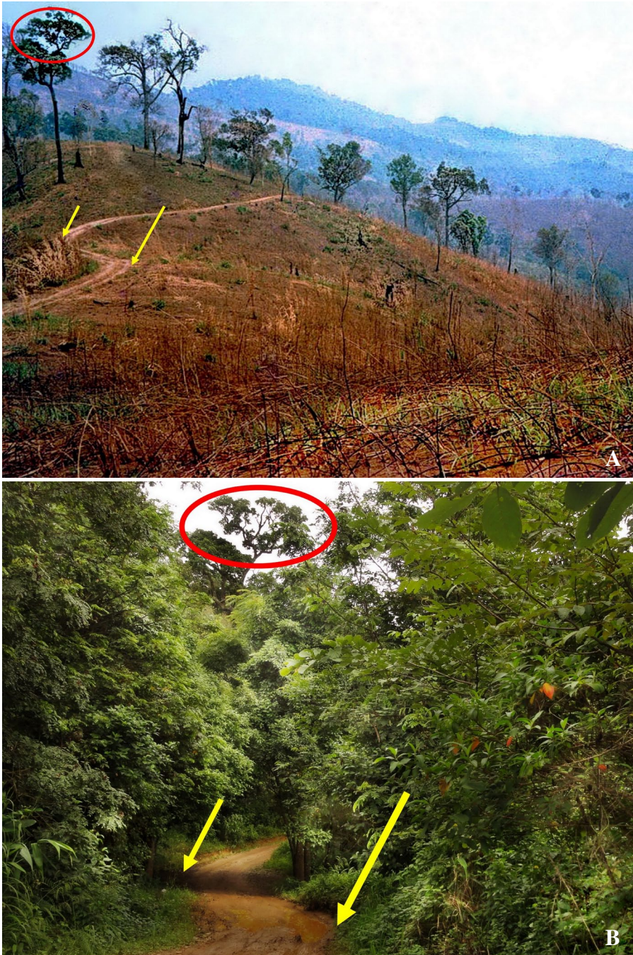
Figure 2. Forest restoration using the framework species method has transformed the landscape of the upper Mae Sa Valley. A, April 1998: fire ravaged the area. B, The bend in the track (yellow arrows) is now over-arched with forest planted in 2001 (left side) and 2007 (right side) (photographed September 2016). The crown of a large tree, which survived the 1998 fires, circled in red serves as a reference point.