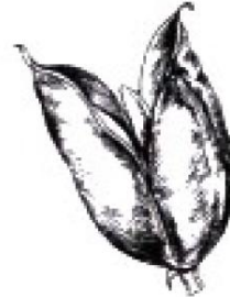
Examples of dry fruit

Dry fruits are ripe when they start to split open. Get fruit from the tree rather than the ground if possible. Climb the tree or shake the branches, or use a cutter mounted on the end of a long pole.