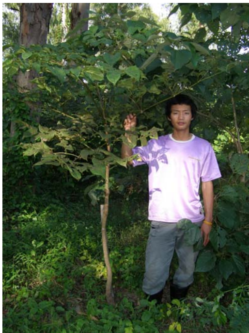
Top left: Ficus callosa 3.5 months after planting. Top Right: Gmelina arborea , beginning to close canopy with neighbouring trees 15.5 months after planting. Mid left: Ficus semicordata 3.5 months after planting. Mid right: Cassia bakeriana 3.5 months after planting. Left: